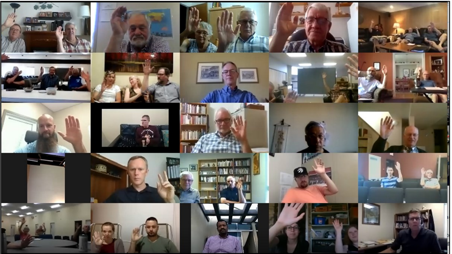
Delegates adopting the minutes, June 27, 2020—note one delegate in this screen joining from Mexico and another from Ethiopia.