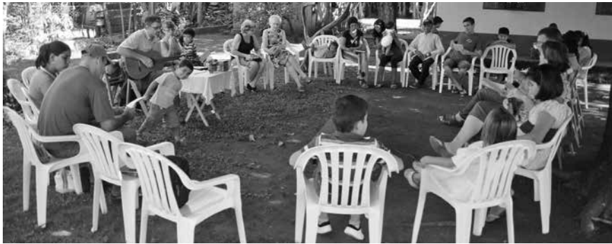
The Minga Guazú church plant in Paraguay is one place where EMC short-term workers can go.

as urgent today as it has ever been. There are still thousands of people groups that are unreached and unengaged, with no credible witness to share the gospel. Even in places where the church has a beginning, there is an ongoing need for career missionaries to walk alongside, train, encourage, and bless the national church workers. Career missionaries make a world of difference.