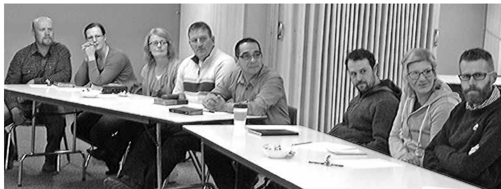
Recently hired ministers at a New Leaders' Orientation.

Another challenge this year has been the delay encountered in the Statement of Faith Review process. In January of this year we rebooted the effort and, for two reasons, sent study guides inviting our churches to study and discuss our articles of faith. The first reason is that it's just