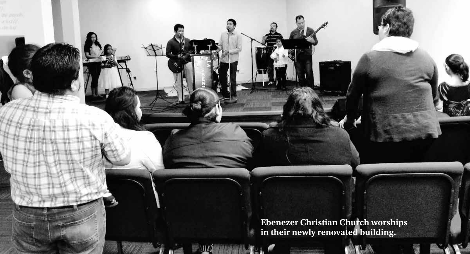
Ebenezer Christian Church worships in their newly renovated building.