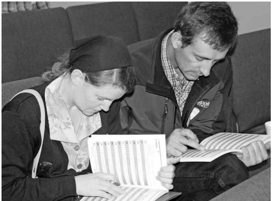
Participants completed a gifts assessment as part of the October 2014 Discover Your Ministry Potential event.