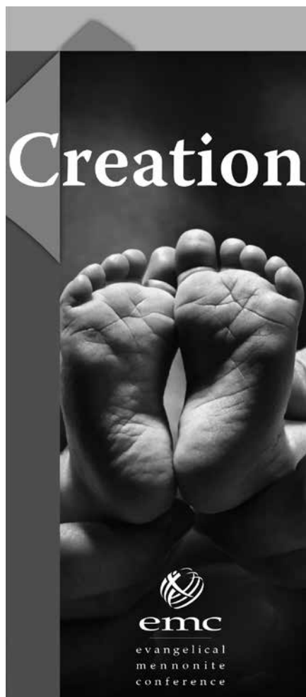
A brochure produced by the General Board in November 2014. Find it on our website.

Strategic Planning - The Conference Council adopted statements of