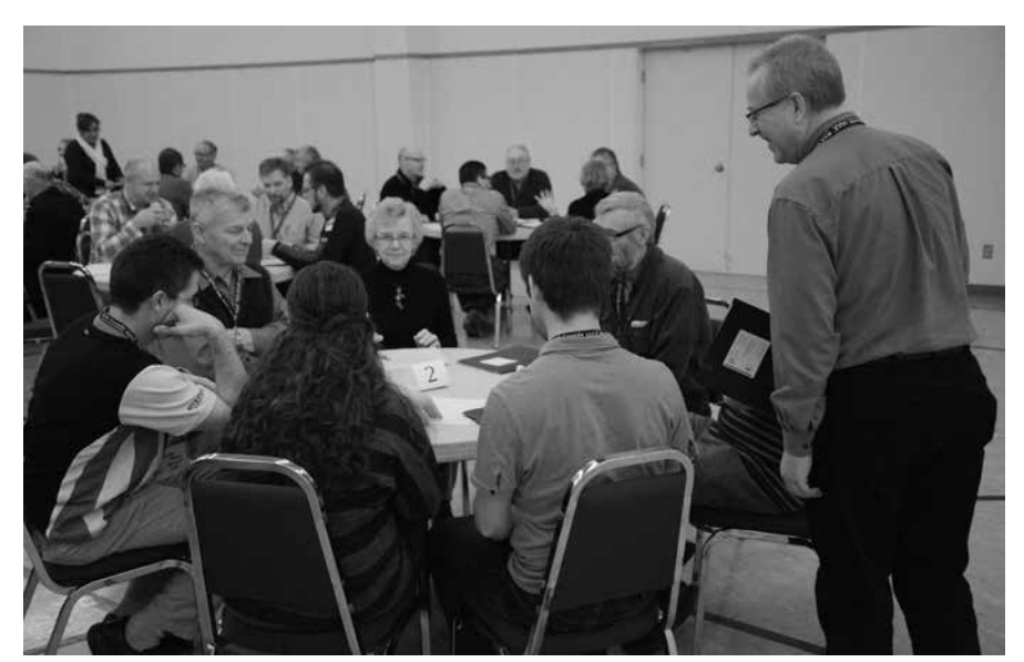
Delegates work around tables to answer questions posed by the Strategic Planning committee on next steps for EMC.