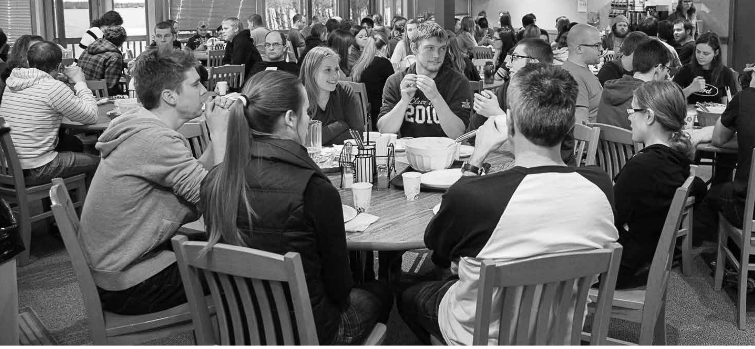
Locally initiated and carried out, the EMC Young Adults Retreat was held on Feb. 28 to March 2, 2014.