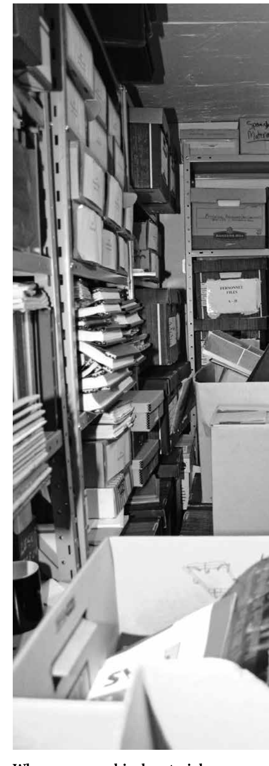
Why are our archival materials being moved to Mennonite Heritage Centre? Space and research accessibility.