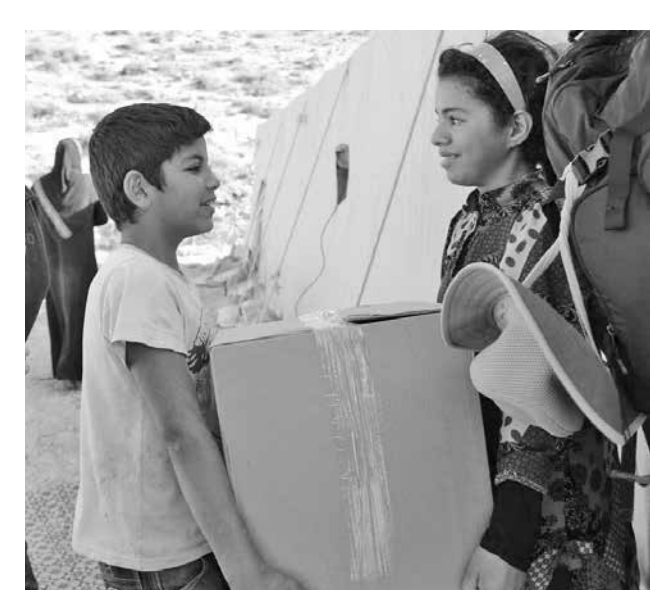
Two children, Syrian refugees living in a tent on the outskirts of Irbid, Jordan, carry a box of food into their tent.

The EMC has been a member of the Mennonite World Conference for many decades. In addition to the assemblies, which are held every six years, being part of this global fellowship of Anabaptist churches enables the EMC to relate with other churches in many countries.