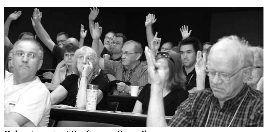
Delegates vote at Conference Council.