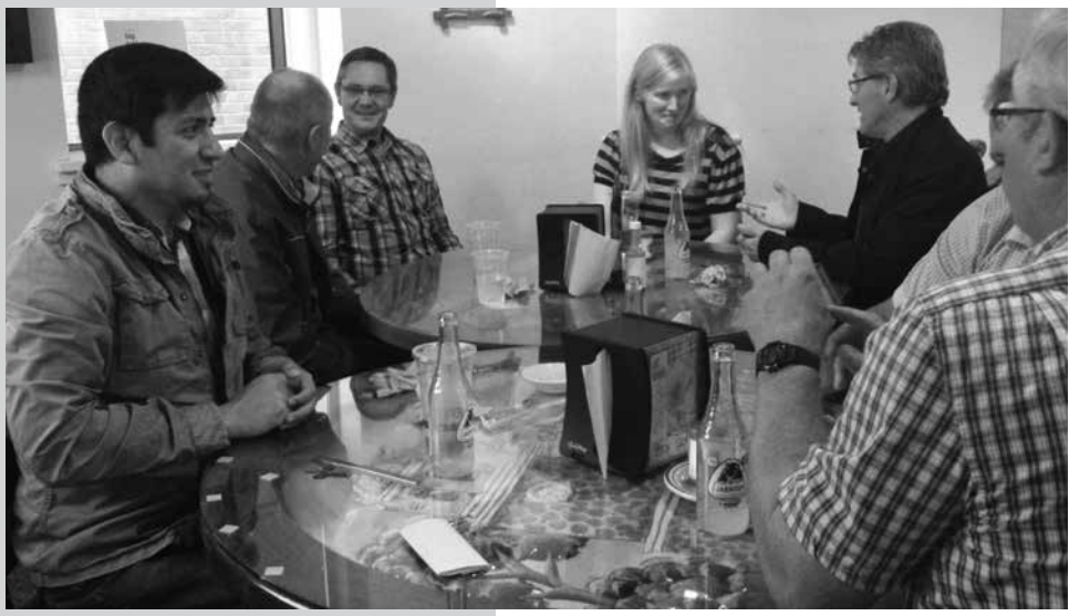
Members of the Church Planting Task Force on a lunch break

The Ebenezer Christian Church in Brandon has completed the